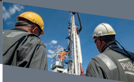
SURFACE AND UNDERGROUND DRILLING WORKS