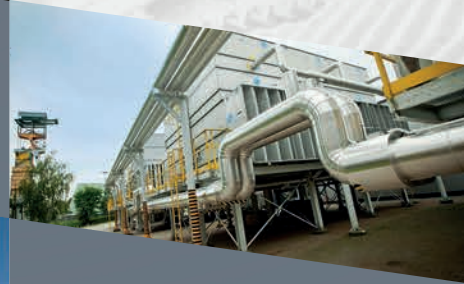
INFRASTRUCTURE CONSTRUCTION ENGINEERING