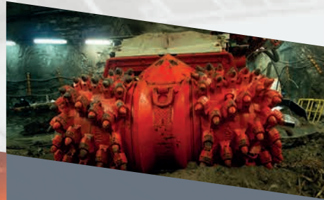
GALLERIES AND CHAMBER WORKINGS